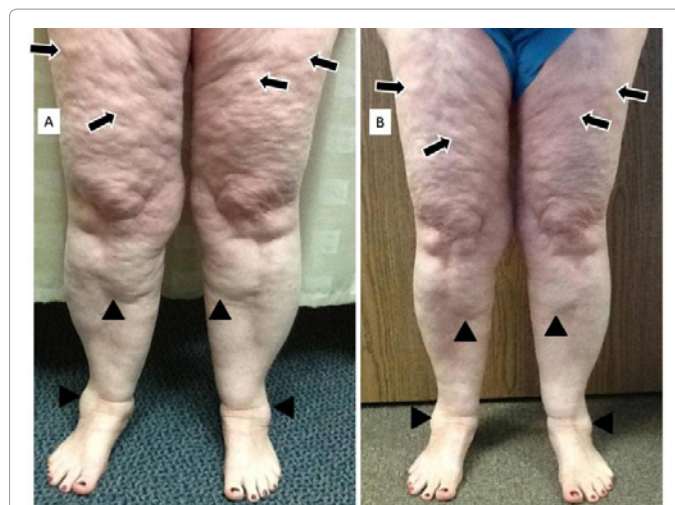
Figure 2: Photograph of patient's lower extremities pre and post-treatment. A) Patient's lower extremities 6 days after initiation of selenium and before physical therapy. Note the raised areas of thin skin in a bubble pattern all over the thighs (some denoted by arrows) and the fat pads on the anterior shins below the knees as well as the pockets of fat on the lateral malleoli (arrowheads). Note also the lack of increased fat on the foot. B) Patient's six month reassessment post treatment and on the last day of perometry measurement (day 293) while taking selenium, Butcher's broom and off pioglitazone. Note that there are fewer raised areas of thin skin in a bubble pattern on the thighs, and that the fat pads below the knee and around the malleoli appear decreased, but are not absent.

The patient underwent physical therapy 4-5 times per week for 6 weeks, during which time she continued her selenium. The patient received MLD with HIVAMAT, and compression bandaging for three weeks for the right lower extremity, and one week for the left lower